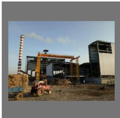
Alcohol Distillation Plant