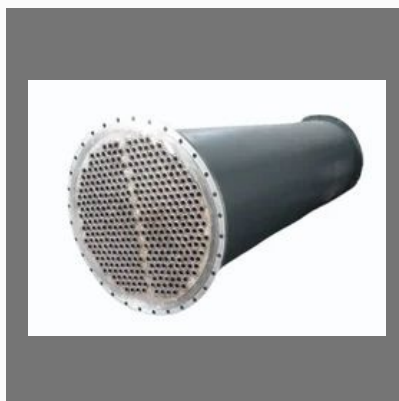
Industrial Heat Exchanger