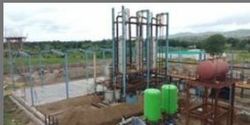
Solid Jaggery Making Plant