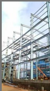
Factory Sheds Fabrication Services