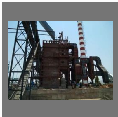
Plastic Pyrolysis Plant