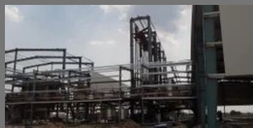
Jaggery Powder Plant