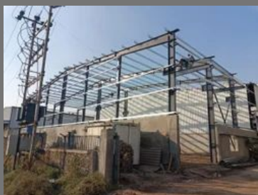
Steel Fabrication Services